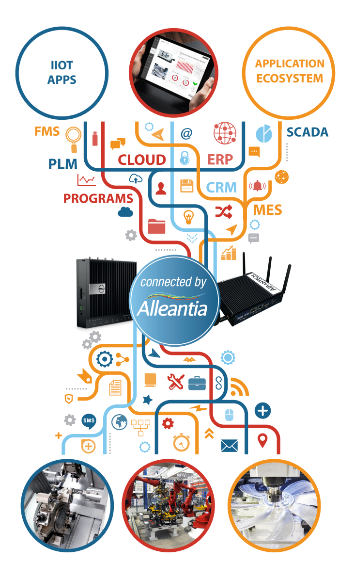
Figure 2. The Alleantia plug-and-play Industry 4.0 solution architecture

Alleantia software utilizes the powerful XPANGO Library of Things, which includes thousands of XPANGO drivers for machines, controllers, inverters, and sensors from many bespoke vendors, plus the free XPANGO driver editor for OEMs and system integrators, creating new drivers for their machines and production systems.